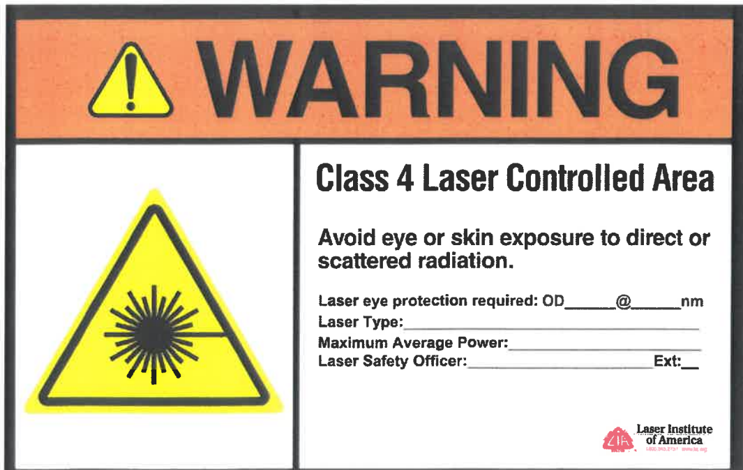
Figure 4. Sample warning sign for Class 4 Laser Controlled Area. Adapted from ANSI Z36.1-2014 (Figure 1c).